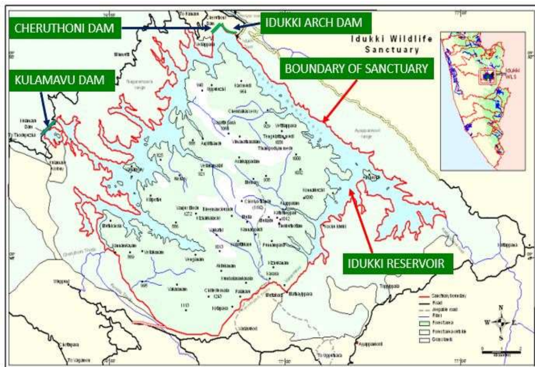
Figure 1: Figure 3.2: Location of dams with respect to the boundary of Idukki WLS

The Idukki dam project was commissioned in 1974. The area near around the upstream boundary of the Idukki reservoir is declared as Idukki Wild Life Sanctuary during 1976. The project is in operation for about 5 decades. The area nearby the dams is inhabited and the district headquarters is within 5 km from dam. Natural forests are not there in the immediate vicinity of the dams. The Idukki Wild Life Sanctuary covers an area 105 km 2 . This includes 59km 2 of submergence area of Idukki reservoir. The proposed interventions are located within the dam or its immediate downstream. Hence these activities do not cause any adverse impact on the flora and fauna in the sanctuary. There will not be any loss trees/vegetation or wild animals due to the proposed rehabilitation in the dams.