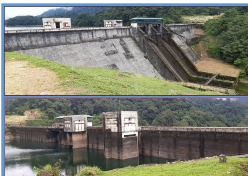
Figure 1.2: Downstream and upstream view of the dam